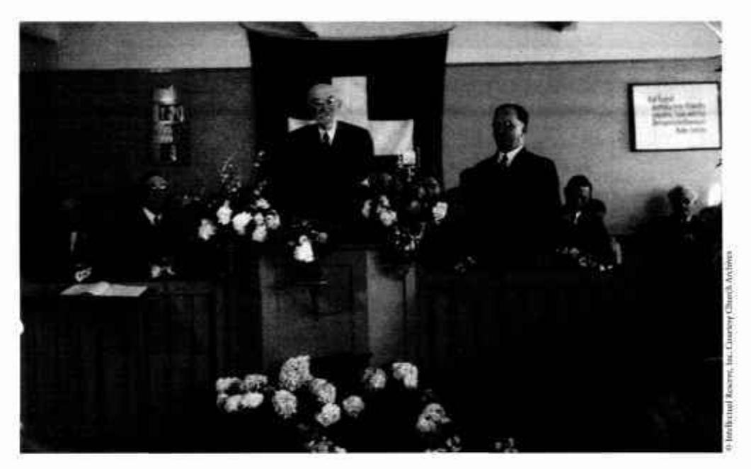
Fig. 5. President Grant addressing the Saints in Basel, Switzerland, with Max Zimmer translating, July 4, 1937. The Swiss flag hangs behind President Grant.