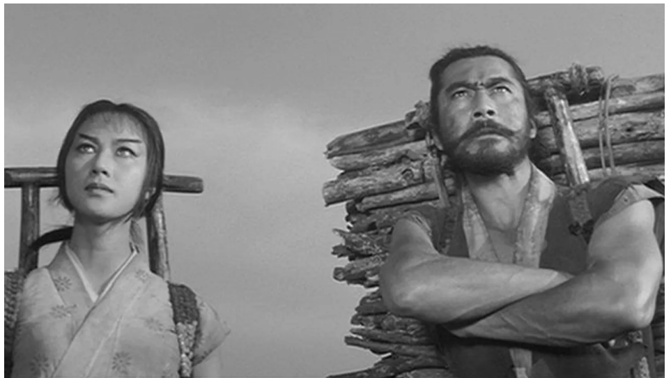
George Lucas considered Toshiro Mifune, who played the general in The Hidden Fortress, for the analogous role of Obi-Wan Kenobi in Star Wars

Some international directors didn't just learn from Kurosawa's deep-focus vistas and propulsive editing, they remade his films wholesale. The Seven Samurai (1954) became John Sturges' The Magnificent Seven (1960). Yojimbo (1961) became Sergio Leone's A Fistful of Dollars (1964). But it was Kurosawa's widescreen epic The Hidden Fortress that fascinated Lucas. For one thing, it had an unusual blend of swashbuckling action and knockabout comedy, fairy-tale archetypes and war-movie grit. And for another, it showed how a civil war might look to a duo of bumbling, bickering nobodies.