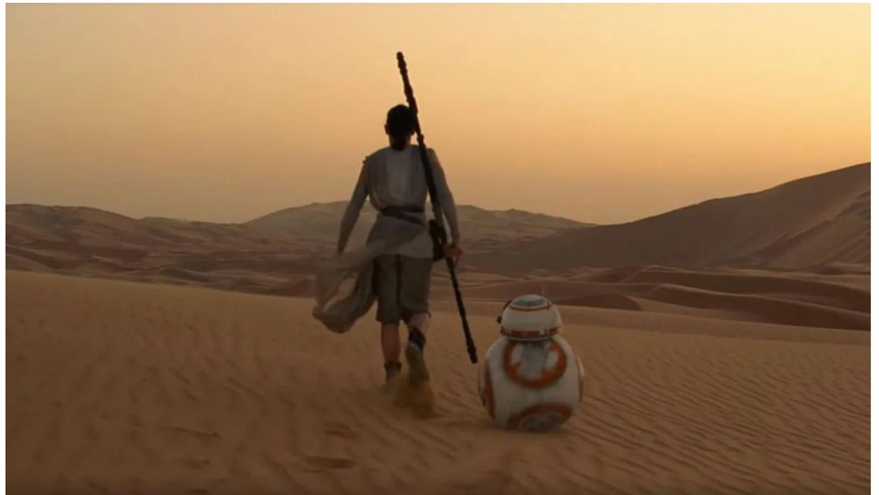
Daisy Ridley's Rey wields a staff in The Force Awakens very much like those of the generals in The Hidden Fortress, suggesting Kurosawa's influence lingers

Peasants aside, Lucas has said that the similarities between Star Wars and The Hidden Fortress are “more of a coincidence than anything else”, but you don't have to peer too closely at Kurosawa's film to spot images, settings and techniques that crop up in Lucas's trilogies. There is the corpulent slave owner who could be a cousin of Jabba the Hutt; there are the mossy forests which anticipate the Ewoks' Endor; and there are the horizontal wipes which both directors use to transition between scenes.