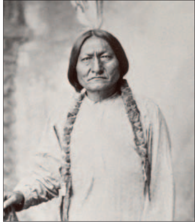
Sitting Bull, late 1880s (Sioux).

of mainstream science since the late 16th century.)