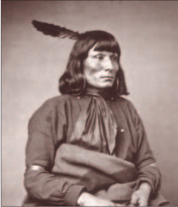
Standing Elk, 1858 (Dakota).